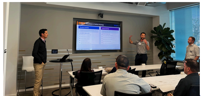
The WCI-GC team breaking down the fundamentals of construction plans for attendees