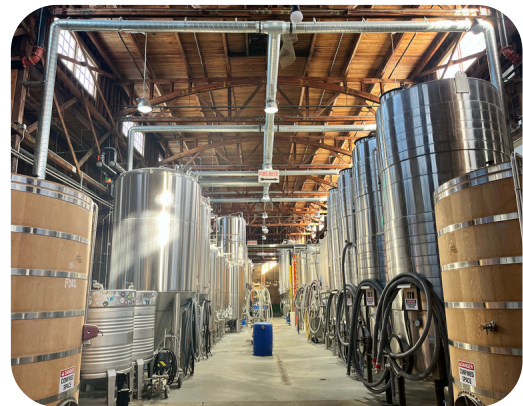
A behind-the-scenes look at Almanac Brewery and the craft behind every pour.