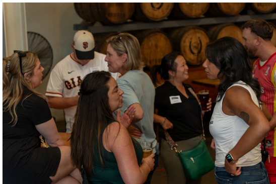
From friendly competition to great conversations, March Madness brought our community together for a night of fun and connection.