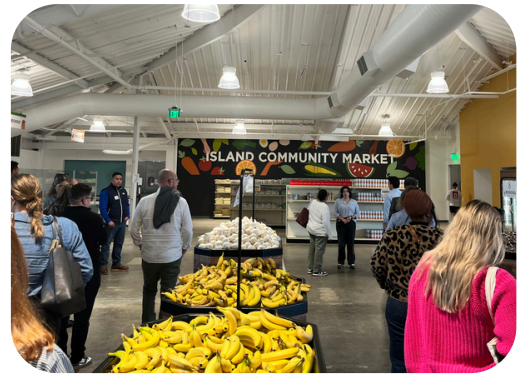
Behind the scenes at the Alameda Food Bank, supporting our community one step at a time.

This tour offered attendees a unique chance to witness firsthand how Alameda Point continues to shape the future of industrial real estate in the East Bay, and provided valuable insights for property owners, managers, engineers, and CRE professionals interested in adaptive reuse and redevelopment trends.